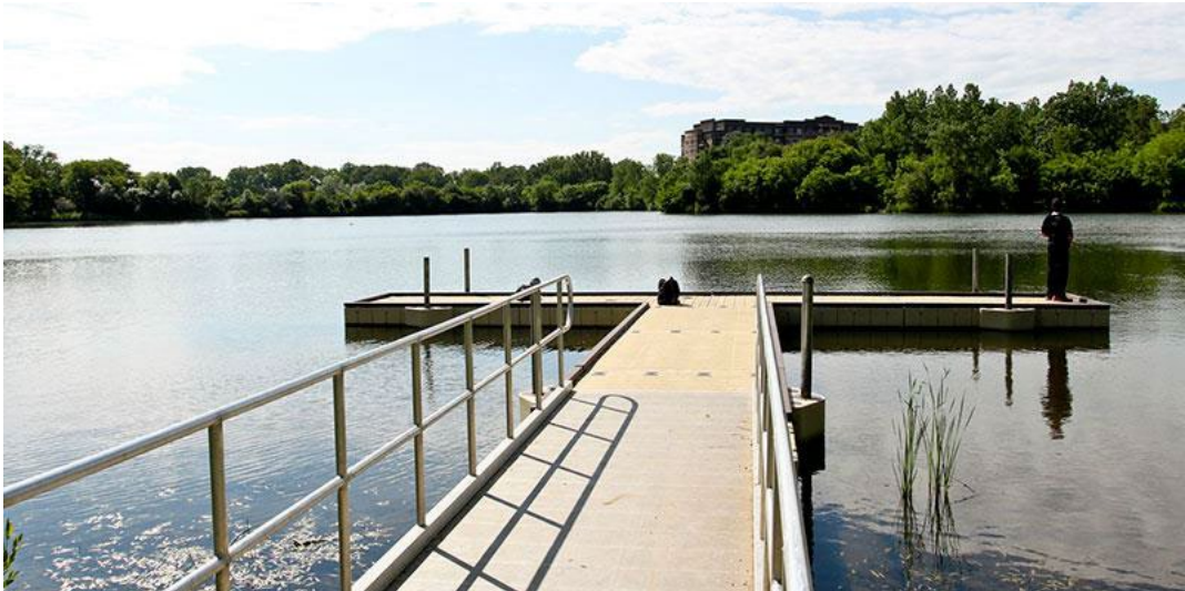
Lakeview Park Pier