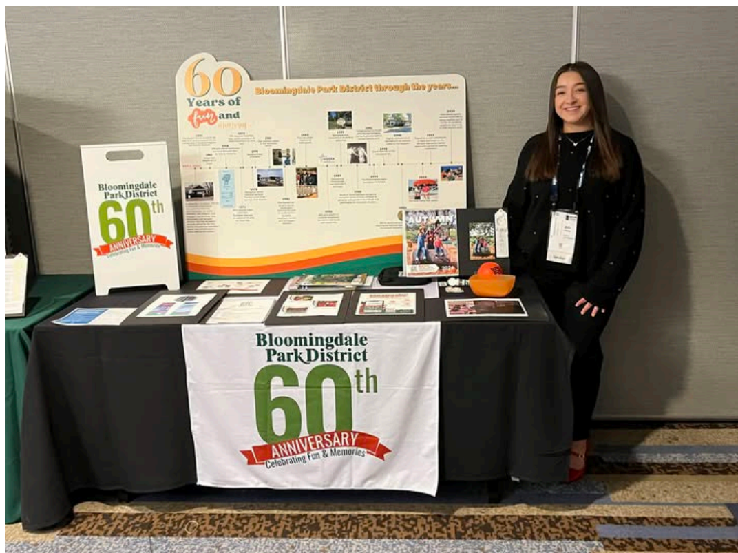
The Bloomingdale Park District is a consistent recipient of many staff, program, and community awards.