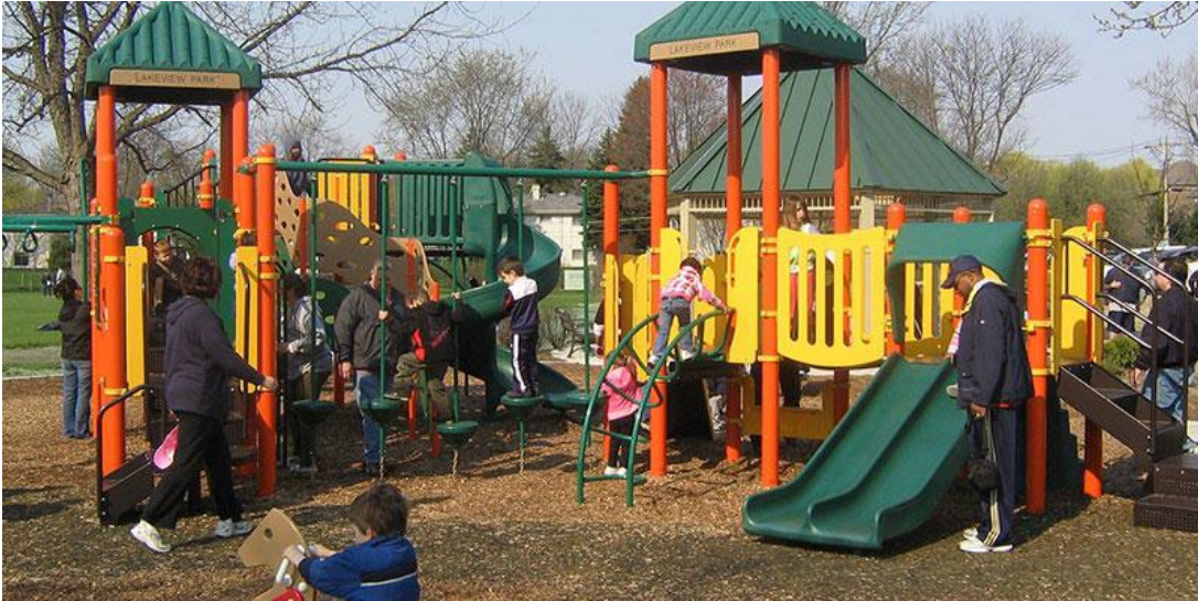
Lakeview Park Playground